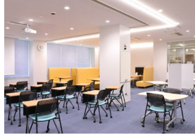
Active Learning Room