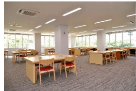
Study and Reading Room

This room is suitable for long hours of study.